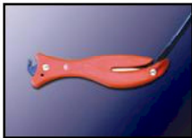
Remove screws with Screwdriver