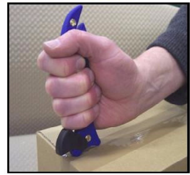
Tape & Card

Also suitable for cutting:- Stretch Wrap, Bubble Wrap, String, Rope etc