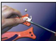
Replace or reverse hook blade with finger