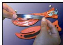
Replace or reverse straight blade by handling blunt edge