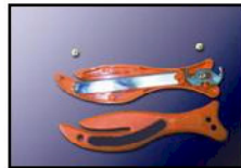
Carefully remove the