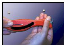
Snap halves firmly back together ensuring there are no gaps.